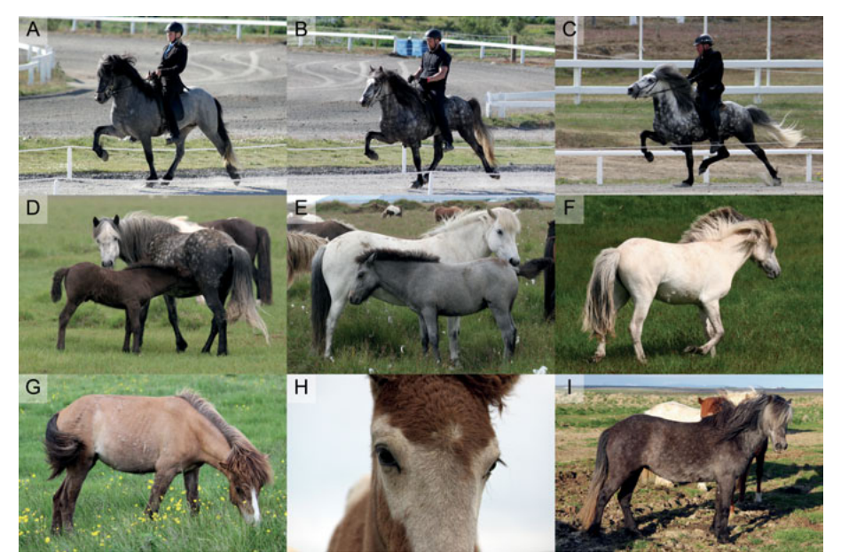
Figure 4 . Icelandic horses depicting various phenotypic aspects of the Greying with Age variant. See text for details.

One commonly variable and well-known factor that affects the rate of hair depigmentation is the colour a horse is born. Variants leading to decreased effectiveness of melanogenesis often cause horses to become white more speedily. For instance, a Palomino born Grey horse will be lighter in shade more quickly than a Chestnut born Grey will, presumably because increased melanogenesis driven by Grey is insufficient to overcome the already present defects in melanogenesis.